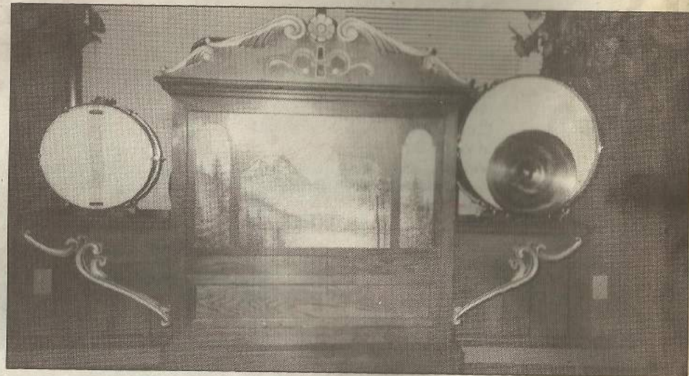
Musical instrument at fair Friday and Saturday

Please come by and enjoy this fine organ while at the Mooreland Free Fair.